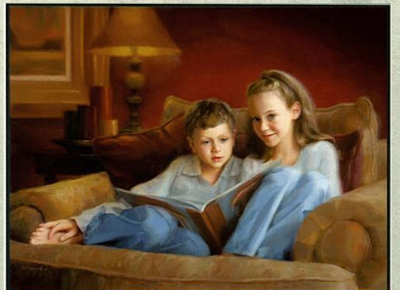
See RUSHWORTH, Page 4 A portrait of two children.

She wanted classical instruction in drawing and painting. So she improved her skills via workshops, books and practice. She